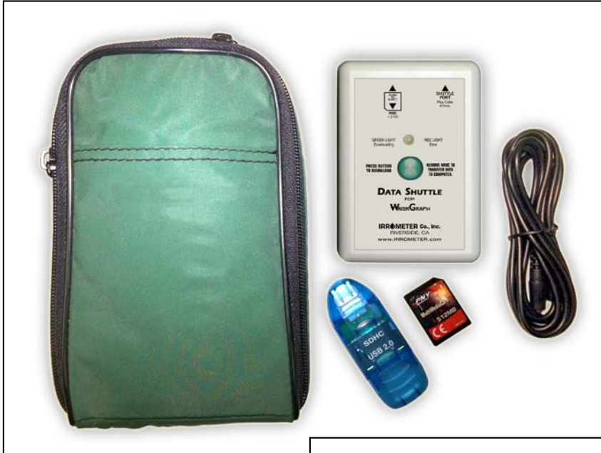
◀ Data Shuttle components.