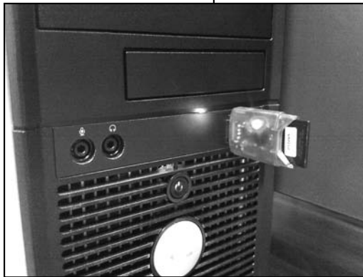
◀ This photo shows card reader downloading transferred files via USB port of a host computer.