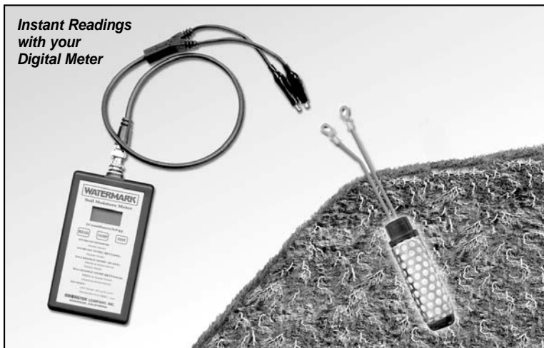
Instant Readings with your Digital Meter

The soil acts as a reservoir to store water between irrigations, or rainfall events, so that it is available to the crop or plants as needed for healthy growth. The purpose of using sensors to measure soil water is to give you a better understanding of how fast water is being depleted in the different areas of your field, so you can better schedule your irrigations and correctly evaluate the effectiveness of any rainfall. By reading the sensors 2-3 times between irrigations, you will gain an accurate picture of this process over time, and develop an irrigation scheduling pattern that meets your crop's "need" for water. This eliminates the guesswork, can result in water savings, lower pumping costs and eliminate excess leaching of nitrogen due to over irrigation.