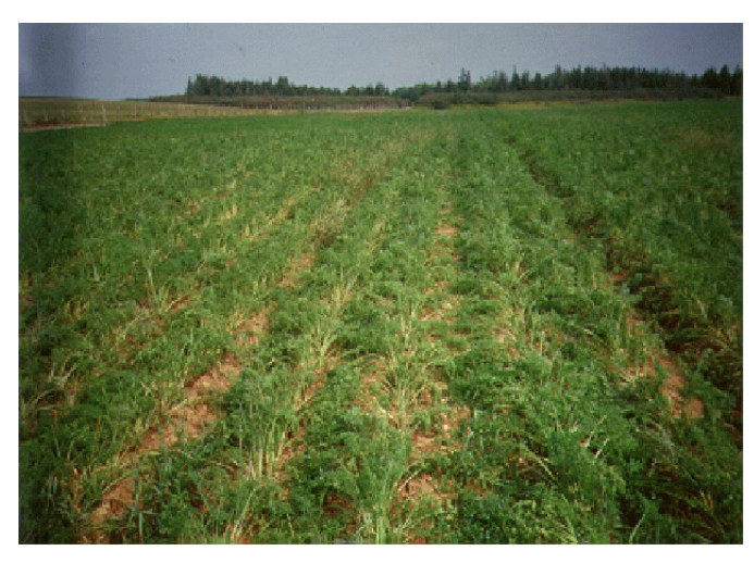
Wilted carrot tops as a result of severe drought

Following crop establishment, carrots can tolerate moderate water deficit which will in fact increase it's ability to cope with occasional periods of soil moisture deficit. Elevated water stress will cause decreases in shoot fresh weight, but will also result in a significant increase in root growth. This will often result in fibrous roots, corky or woody roots, poor tops which would impede mechanical harvesting. Decreasing soil moisture will force the plants to invest in root extension growth for water harnessing rather than storage root development. This will result in a reduction in root yield and recovery especially in diced carrots where a larger (girth) root is required.