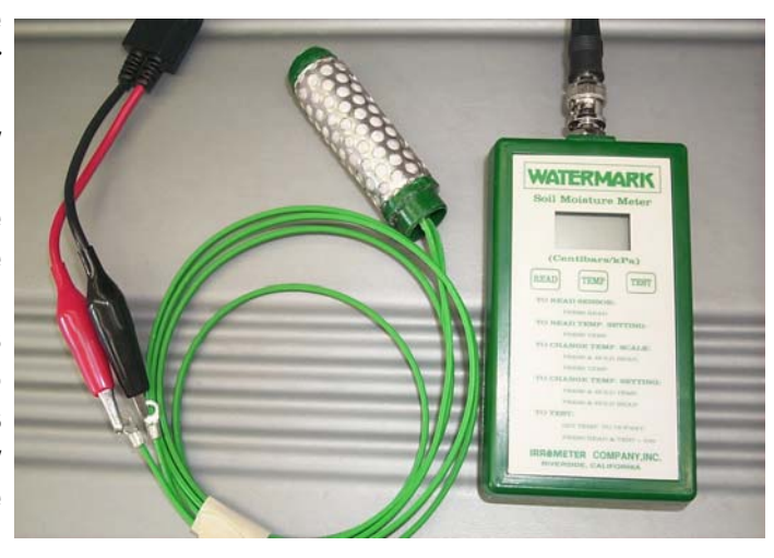
Electrical resistance block soil moisture probe with hand-held reader

feeling the soil by hand to using satellite remote The recommended method for sensing. maritime carrot production is using electrical They are relatively resistance blocks. inexpensive and can be inserted into the soil quickly and removed before harvest. A simple hand-held reader is easily connected to the electrical contacts on the moisture block and an instantaneous measurement of soil moisture is given. Soil moisture should be measured at 1/3 of the root zone depth, approximately 6 inches for carrots. Readings should be taken weekly under normal conditions and at least twice weekly during drier periods.