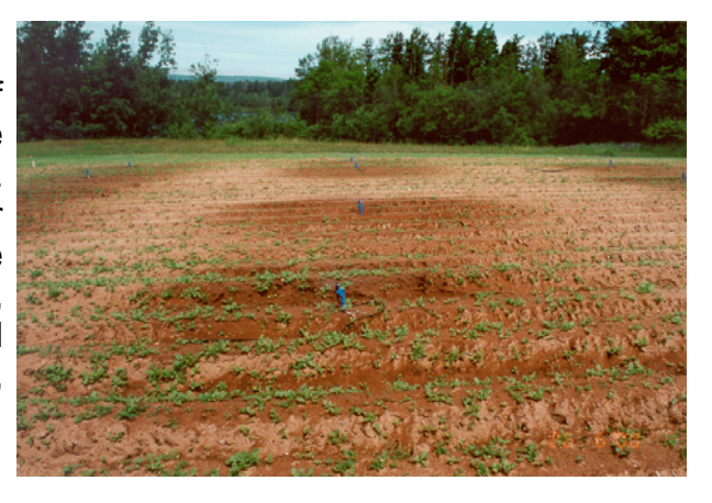
Microsprinkler irrigation system used for Irrigation Management trials conducted by the PCRP

The most common and efficient method of supplemental irrigation for carrot production in the Maritimes is the sprinkler class of irrigation systems. Typically used are reel/traveling gun and to a lesser extent, center pivot systems. Reel systems require more labour to operate compared to center pivot, however they are suitable for use in irregular shaped fields. Center pivot systems are limited to circular, rectangular or square fields.