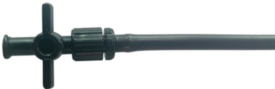
Fig. 2 - Valve closed