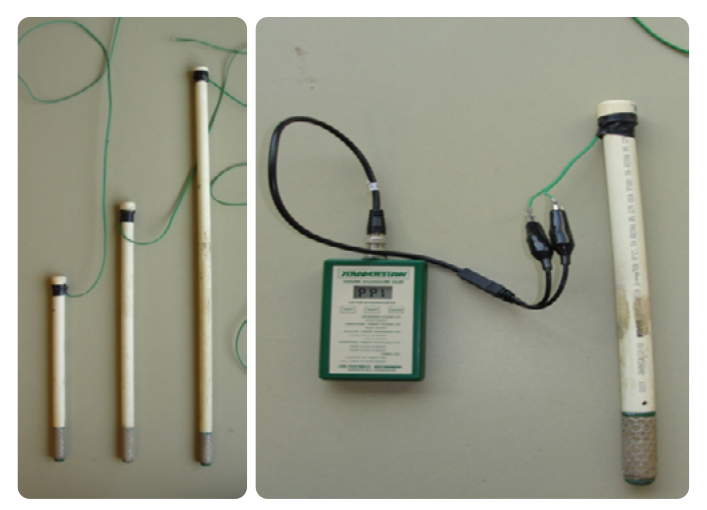
Figure 1. Manual reader and Watermark™ sensors installed on CPVC pipe for installation and different depths.

Soil water content of soils varies by texture, soil organic matter and compaction. Therefore, field capacity and the soils ability to hold water vary and must be determined for each installation. In general, clayey soils contain smaller pores and have a greater ability to retain moisture in the matrix because it takes more energy to extract the water from the matrix. In sandy soils, the pore spaces are large and since water is easily extracted from large pores, less water is available once the pores have been emptied.