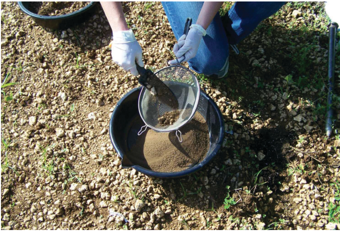
Figure 9. Sieving soil for making the slurry.