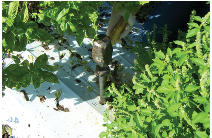
Figure 8. Hammering in the rod to make a hole for the tensiometer.