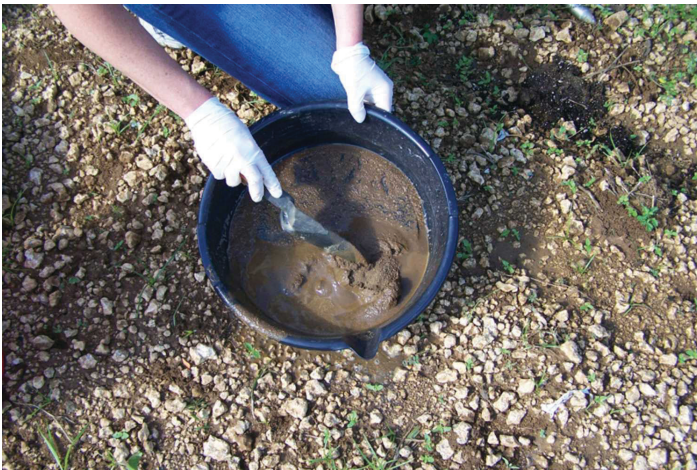
Figure 10. Mixing the sieved soil with water to make a slurry.