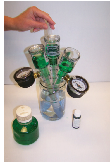
Figure 5. Checking for air bubbles trapped in the tensiometer column.