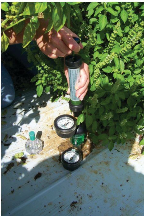
Figure 14. Servicing tensiometer in the field; applying pressure with vacuum pump.