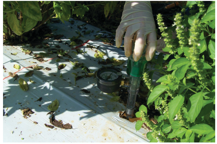
Figure 12. Placing tensiometer into hole with slurry.