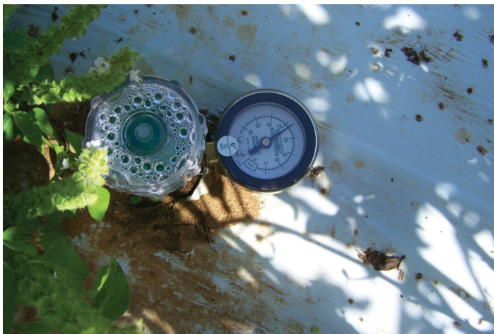
Figure 1. Example of a tensiometer's vacuum gauge.

A tensiometer is a simple and relatively inexpensive tool that can be used to schedule irrigation in Miami-Dade County vegetable crops. Tensiometers continuously measure soil water potential or tension, which is a measure of soil moisture or soil water content. This is generally expressed in centibars (cbar) on a tensiometer vacuum gauge (Figure 1). If the tension in the soil is high, plants have to use more energy to extract soil water. If tension in the soil is low, then plants have lower energy requirements to extract soil water.