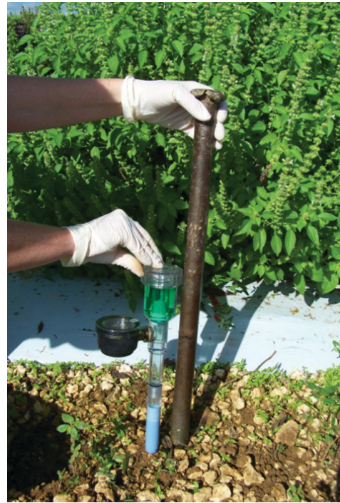
Figure 7. Rod used to make hole for tensiometer installation in the field.