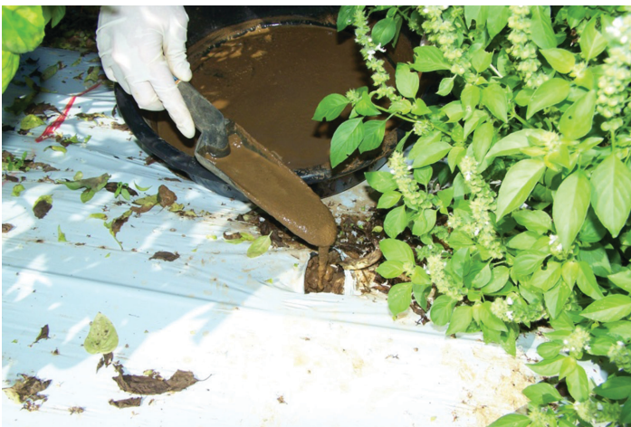
Figure 11. Pouring slurry into the tensiometer hole.