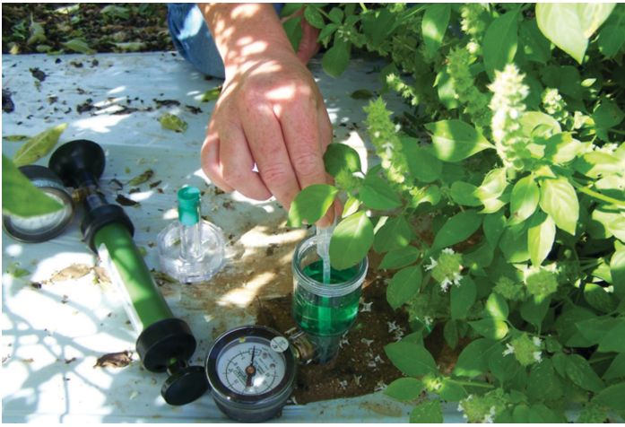
Figure 13. Servicing a tensiometer in the field; purging bubbles from water column.