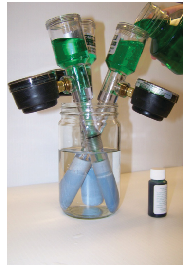
Figure 4. Filling tensiometers with water mixed with biocide.