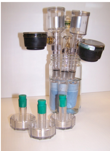
Figure 3. Soaking tensiometers in clean water overnight.

Tensiometers require some preparation before being installed in the field. Each manufacturer will supply specific directions for their device. Generally, tensiometers must be soaked in clean water overnight (Figure 3). Then the tensiometers are filled past the rubber stopper seal point, filling the reservoir (Figure 4). It is recommended that the clean water be mixed with a biocide (usually available from the tensiometer manufacturer). A clean poker should also be used to ensure that the column has filled and air bubbles are not trapped (Figure 5). Next, pressure is applied to make sure the tensiometers are working correctly. A pump with a vacuum gauge is ideal to do this so that the two gauges can be compared (Figure 6). If the tensiometer can hold pressure and no bubbles appear, the tensiometer is functioning properly. If bubbles occur, there is an air leak and the tensiometer needs further maintenance. The tensiometers should be stored with the caps on and ceramic tips in water until they are installed to prevent draining.