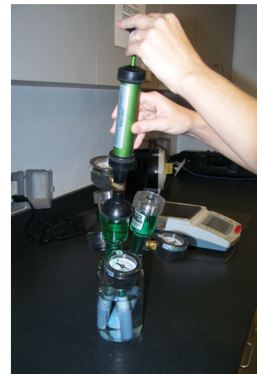
Figure 6. Applying pressure using a handheld vacuum pump.